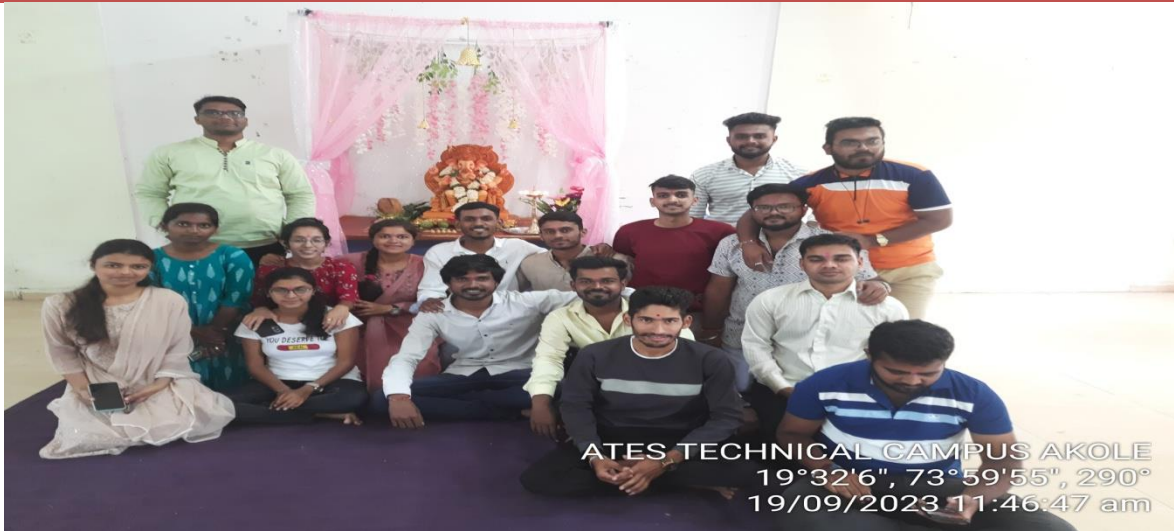
ATES TECHNICAL CAMPUS AKOLE 19°32'6", 73°59'55", 290° 19/09/2023 11:46:47 am