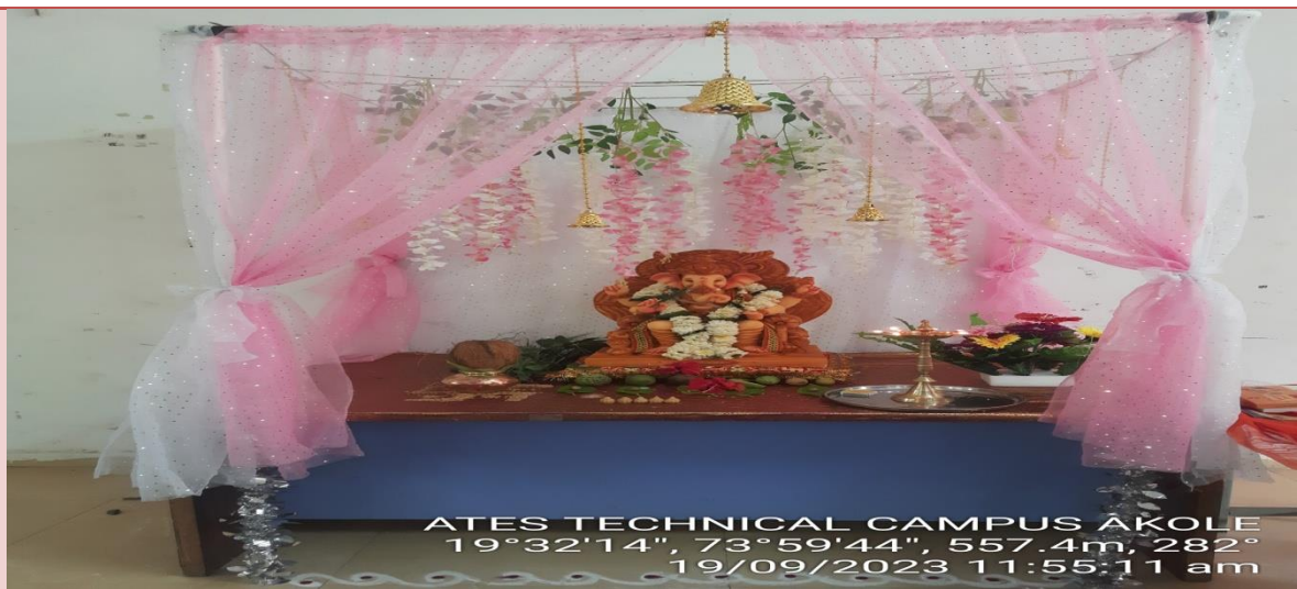
ATES TECHNICAL CAMPUS AKOLE 19°32'14", 73°59'44", 557.4m, 282° 19/09/2023 11:55:11 am