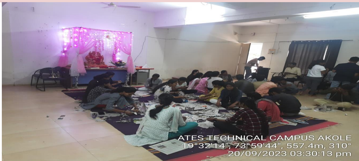
ATES TECHNICAL CAMPUS AKOLE 19°32'14", 73°59'44", 557.4m, 310° 20/09/2023 03:30:13 pm