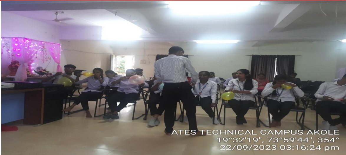
ATES TECHNICAL CAMPUS AKOLE 19°32'19", 73°59'44", 354° 22/09/2023 03:16:24 pm