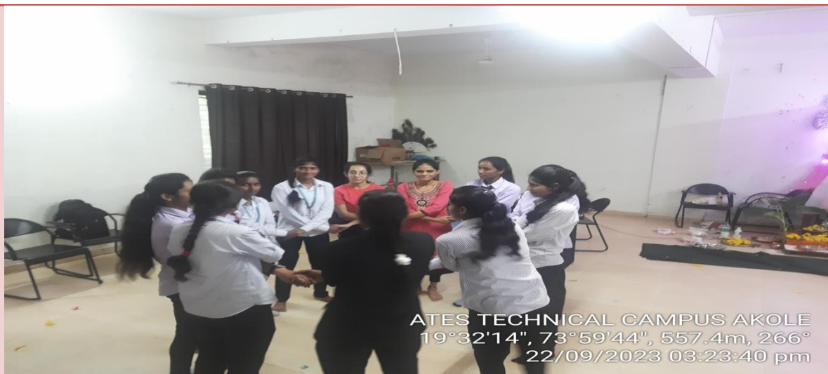
ATES TECHNICAL CAMPUS AKOLE 19°32'14", 73°59'44", 557.4m, 266° 22/09/2023 03:23:40 pm