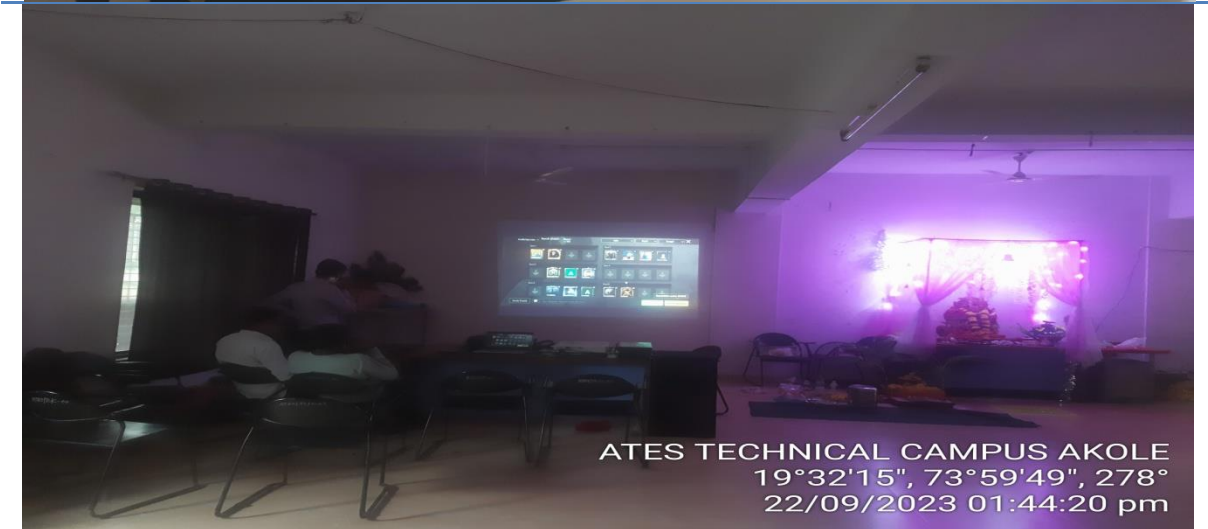
ATES TECHNICAL CAMPUS AKOLE 19°32'15", 73°59'49", 278° 22/09/2023 01:44:20 pm