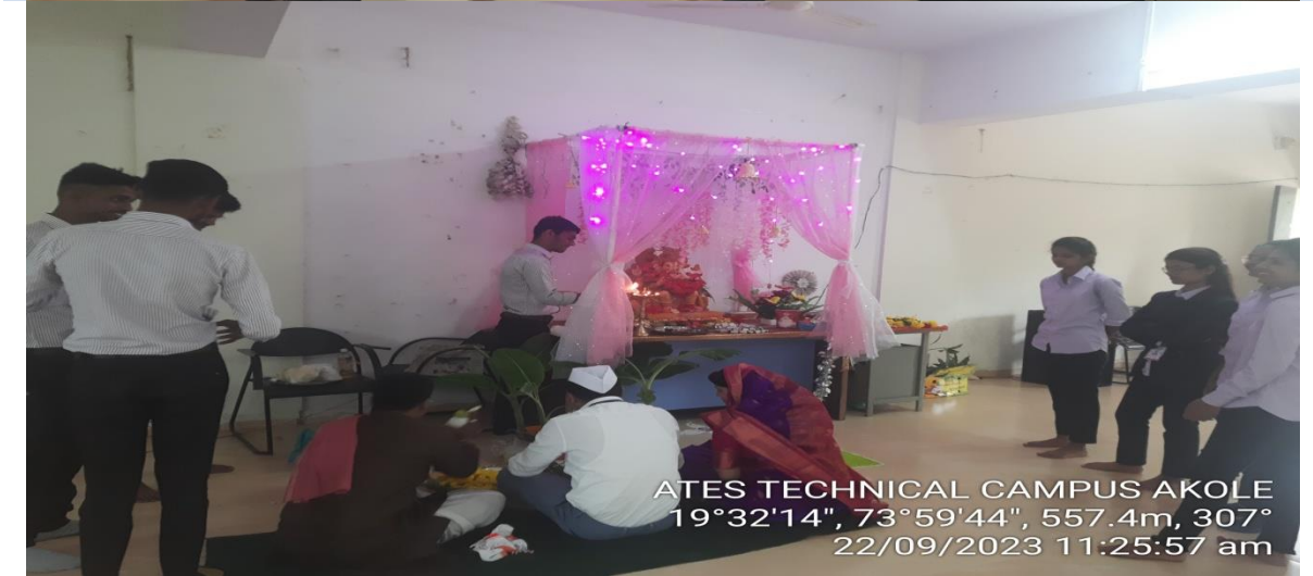
ATES TECHNICAL CAMPUS AKOLE 19°32'14", 73°59'44", 557.4m, 307° 22/09/2023 11:25:57 am