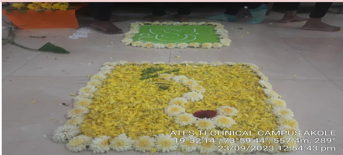
ATES TECHNICAL CAMPUS AKOLE 19°32'14", 73°59'44", 557.4m, 289° 23/09/2023 12:54:43 pm